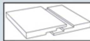
Prepared Step Splice